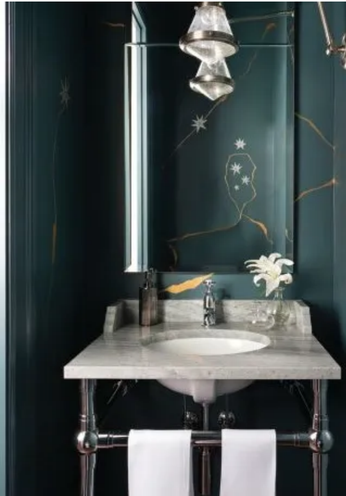
The powder bath was one of Melanie's fav... »