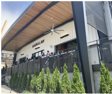
Attendees check out Mabra Law’s new building in Atlanta at its grand opening on Sept. 30.